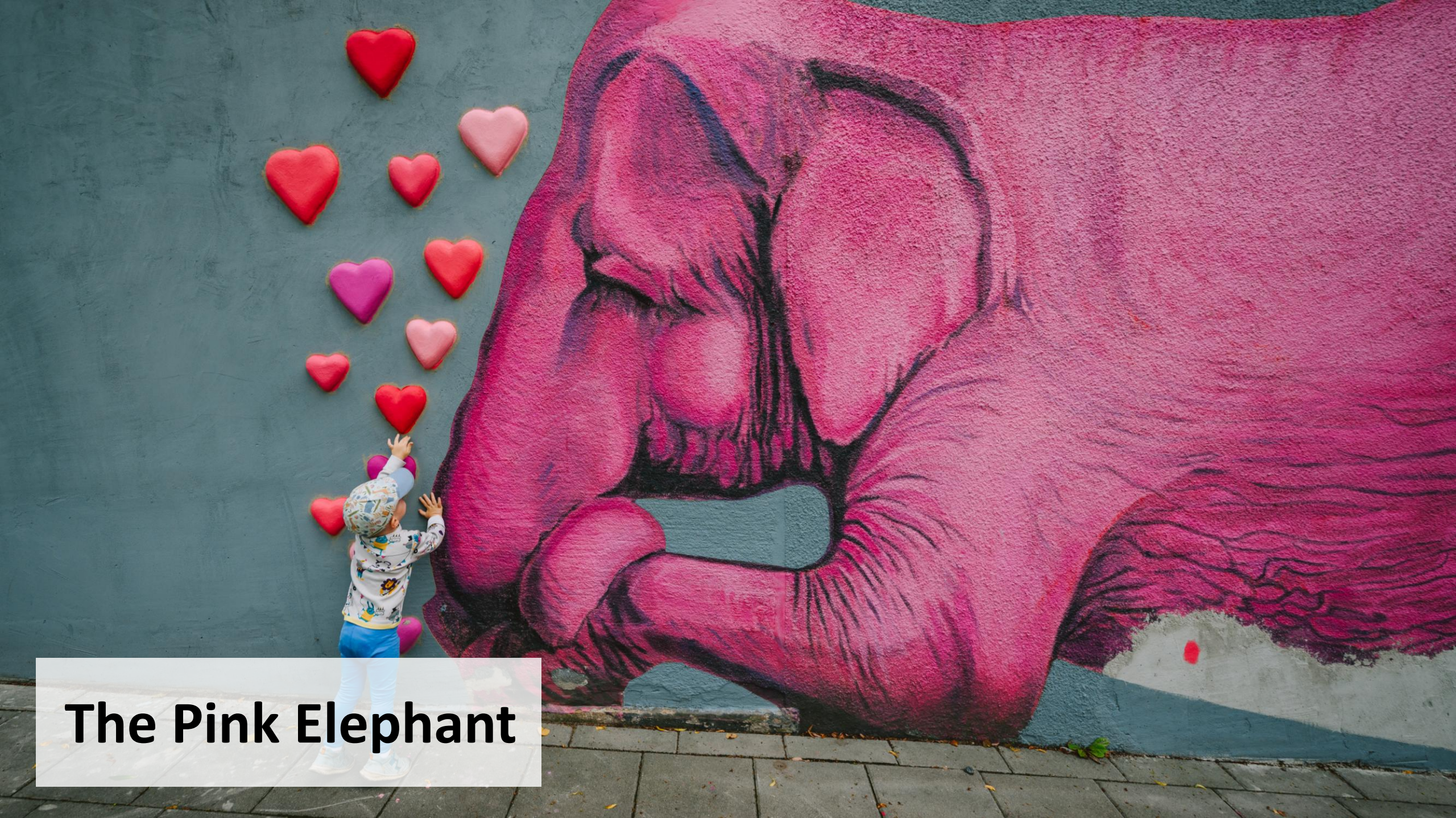
The Pink Elephant